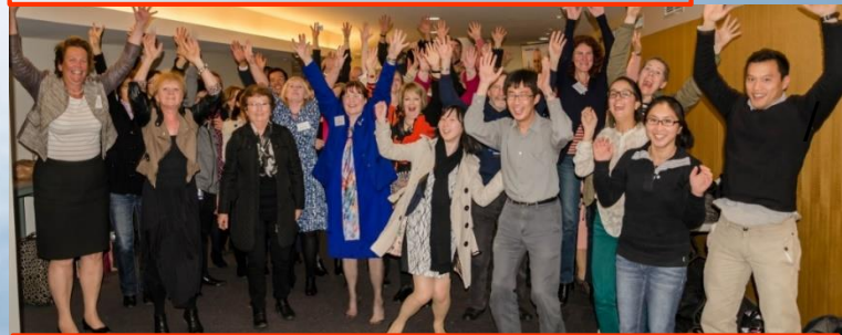
'Jump for Dystonia' at 2014 DNA Seminar