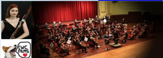
The short film 'Dystonia'